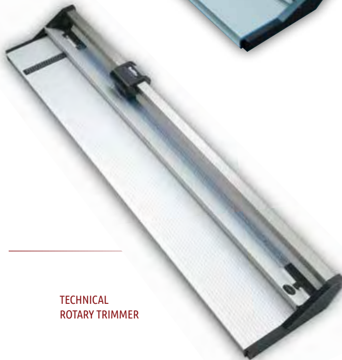
TECHNICAL ROTARY TRIMMER