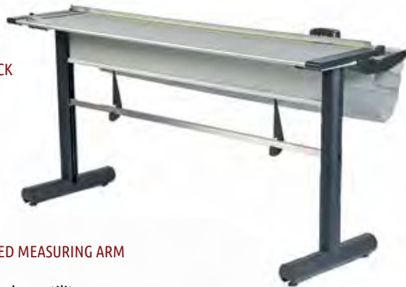
ARC ON STAND PACK

The quality Keencut steel stand with its smooth black finish brings the cutter to a comfortable 36" H waist height. The Stand Package includes the standard 36" high steel stand, but also adds a waste catcher that collects off cuts into a neat catch basin, as well as a roll feeder bar positioned between the stand legs that enables users to cut directly from roll media.