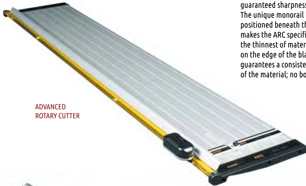
ADVANCED ROTARY CUTTER

THE KEENCUT ADVANCED ROTARY CUTTER (ARC) is the only rotary trimmer with dual cutting wheels, providing two-way cutting flexibility and guaranteed sharpness with tungsten steel blades. The unique monorail bearing system design, positioned beneath the surface of the baseboard, makes the ARC specifically suited for cutting even the thinnest of materials without their buckling on the edge of the blade. Additionally, the ARC guarantees a consistent cut over the entire length of the material; no bows or buckles in the middle.