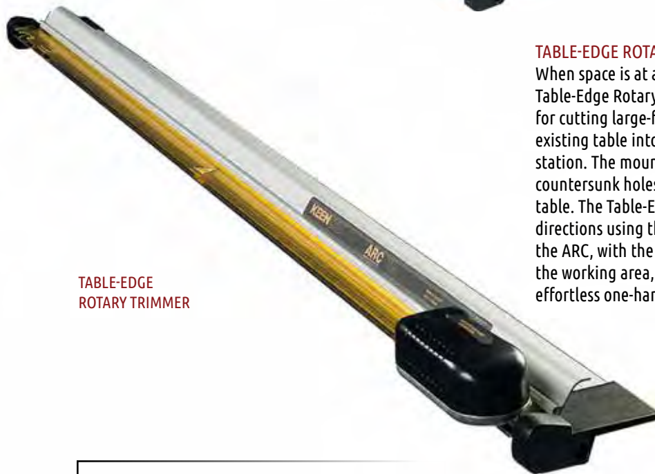
TABLE-EDGE ROTARY TRIMMER

TABLE-EDGE ROTARY TRIMMER (TE) When space is at a premium, the Keencut Table-Edge Rotary Trimmer is the perfect solution for cutting large-format materials, turning an existing table into a complete print finishing station. The mounting plate, with predrilled, countersunk holes, butts flush to the edge of a table. The Table-Edge Rotary Trimmer cuts in both directions using the same patented technology as the ARC, with the added advantage of increasing the working area, enabling easy alignment and effortless one-handed trimming.