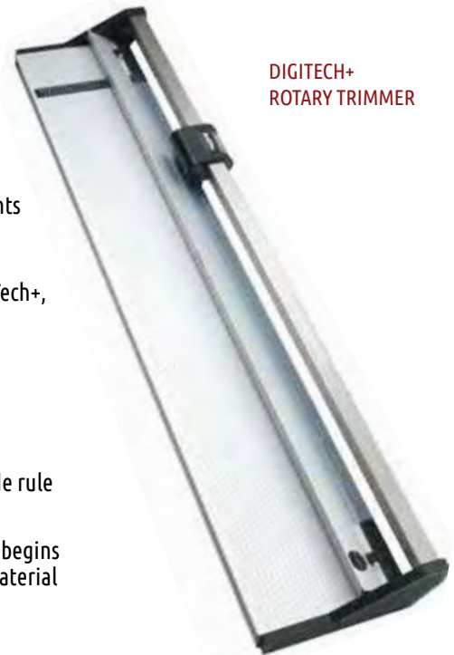
DIGITECH+ ROTARY TRIMMER

See our Warranty Guide on the back cover.