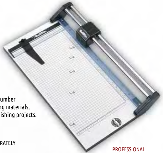
PROFESSIONAL ROTARY TRIMMER