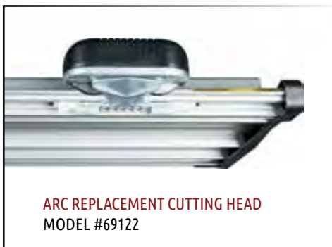
ARC REPLACEMENT CUTTING HEAD MODEL #69122

TABLE-EDGE ROTARY TRIMMER (TE) When space is at a premium, the Keencut Table-Edge Rotary Trimmer is the perfect solution for cutting large-format materials, turning an existing table into a complete print finishing station. The mounting plate, with predrilled, countersunk holes, butts flush to the edge of a table. The Table-Edge Rotary Trimmer cuts in both directions using the same patented technology as the ARC, with the added advantage of increasing the working area, enabling easy alignment and effortless one-handed trimming.