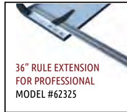
36" RULE EXTENSION FOR PROFESSIONAL MODEL #62325