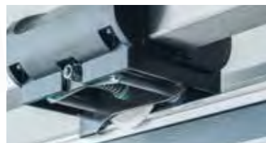
Technical Triple Roller