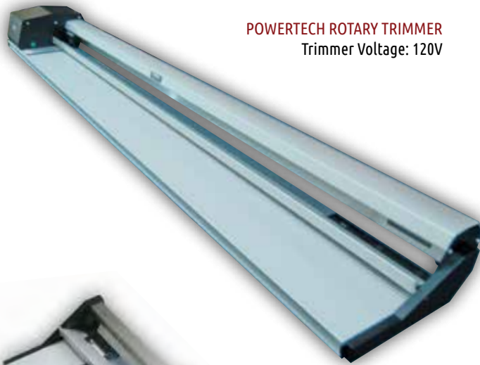
POWERTECH ROTARY TRIMMER Trimmer Voltage: 120V