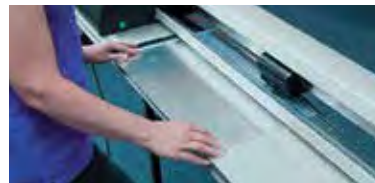
PowerTech cuts up to 3mm flexible substrates